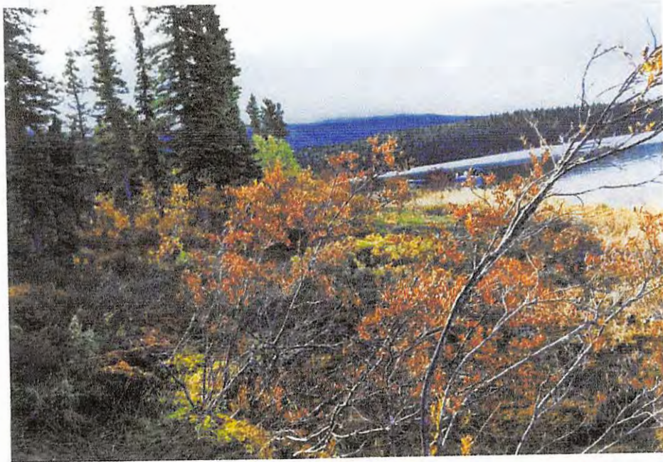
ABOVE: Looking south along the shoreline, taken from the southwest corner of the subject.