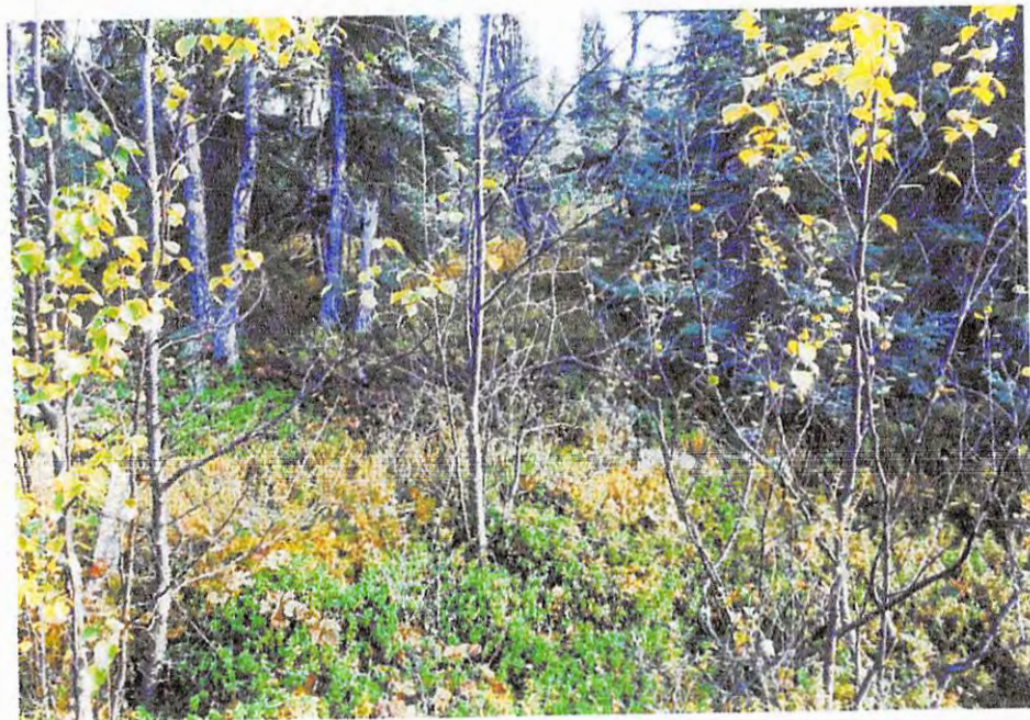
BELOW: Looking east across the subject, taken from the southwest corner of the subject.